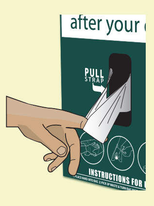
SINGLE BAG DISPENSING Dispenses one bag at a time. Less maintenance. Less waste.