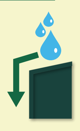
RAIN SHED DESIGN A 22° slope sheds water and deters bird "perching."