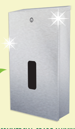
COMMERCIAL GRADE ALUMINUM No rust aluminum for years of service.

Quality Materials • Weatherproof • Less Maintenance