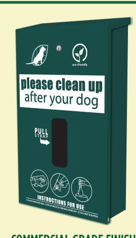
COMMERCIAL GRADE FINISH Powder Coated, UV Protected Creates a professional image that lasts.