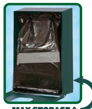
MAX STORAGE &